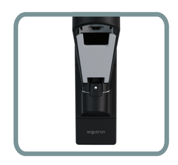
NEW ROTATION STOP: PREVENT DAMAGE TO WALLS, PARTITIONS, OR CUBICLES