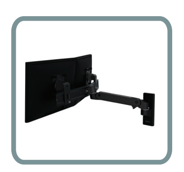
DUAL DIRECT KIT