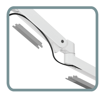
ADDED CABLE COVER: FASTER INSTALLATION AND SLEEKER LOOK