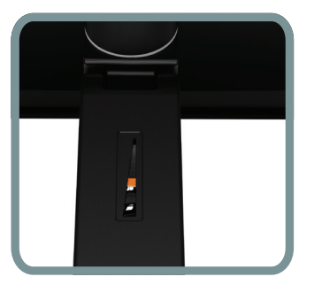
NEW TENSION INDICATOR: SET TENSION LEVEL ONCE AND REPEAT FOR QUICK INSTALL OF MULTIPLE WORKSTATIONS