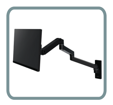
MONITOR ARM EXTENSION