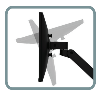
INCREASED TILT RANGE: BETTER ERGONOMICS FOR USERS