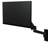
LX Pro Wall Monitor Arm