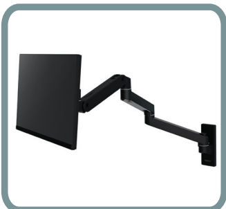
MONITOR ARM EXTENSION