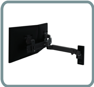
DUAL DIRECT KIT