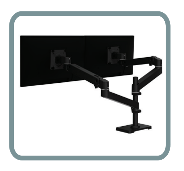
ADD AN ARM (SINGLE TO DUAL)