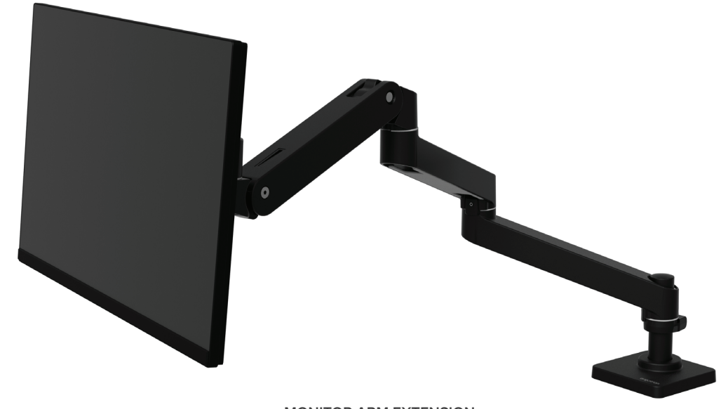
MONITOR ARM EXTENSION