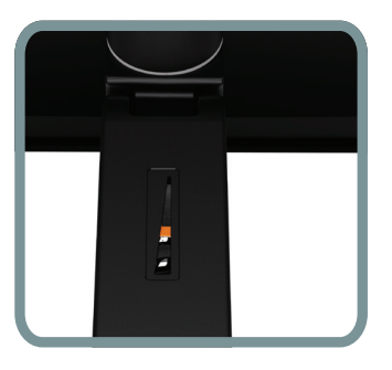
NEW TENSION INDICATOR SET TENSION LEVEL ONCE AND REPEAT FOR QUICK INSTALL OF MULTIPLE WORKSTATIONS