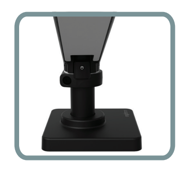
NEW ROTATION STOP PREVENT DAMAGE TO WALLS, PARTITIONS, OR CUBICLES