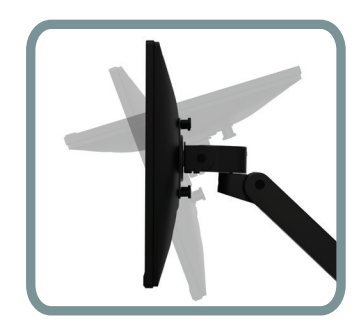
INCREASED TILT RANGE BETTER ERGONOMICS FOR USERS